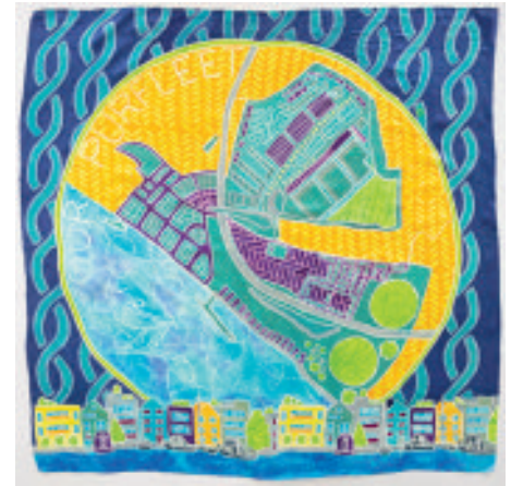
PCRL - designed by Ding Ding