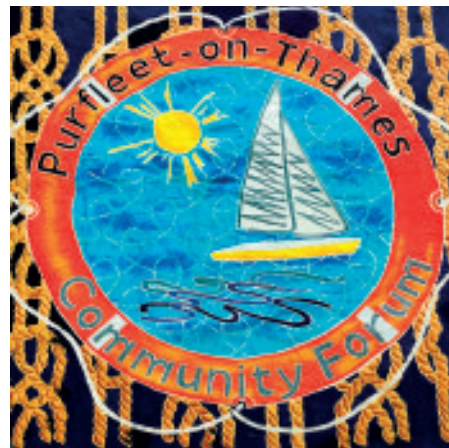
Community Forum - designed by Kinetika