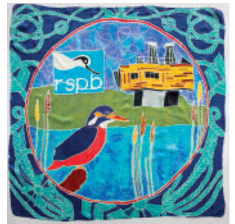
RSPB - designed by Andrew Gouldstone

■ These are just four examples of the wonderful, colourful flags designed and painted with Kinetika by the community for the community. To view all 25 please go to: kinetika.co.uk/portfolio/purfleet-flags