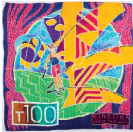
Kinetika - designed by Lisa Meehan

Use our pull-out template provided to create your flag!