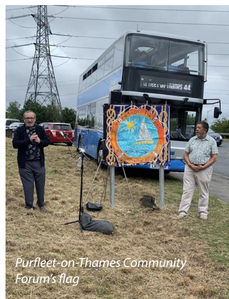
Purfleet-on-Thames Community Forum's flag